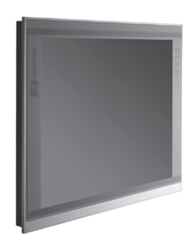
▲ Ultra-slim mechanism design