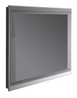
▲ Ultra-slim mechanism design