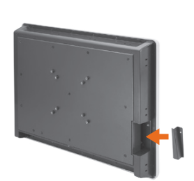
▲ CFast™ slot with protective cover