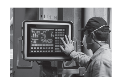
▲ Ideal for factory automation & self-service kiosk in retail