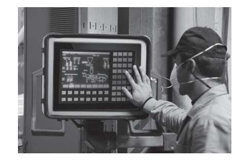
▲ Ideal for factory automation & self-service kiosk in retail