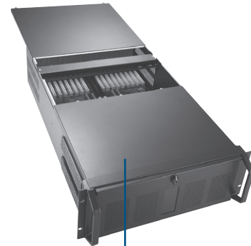
Dual top cover design for easy maintenance